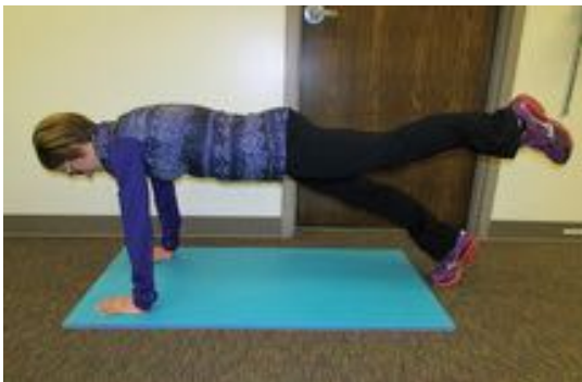
High Plank with Hip Extension